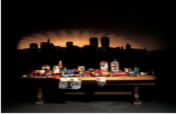
A shadow art piece made from household junk

Please send all photos of your child's shadow show, their plan and written story to bilston.ps@midlothian.gov.uk i will then add these to your child's learning profiles..